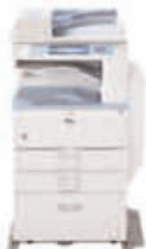
MP 2550B/MP 3350B