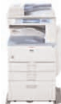
MP 2550SPF/MP 3350SPF

For exceptional black & white printing and color and black & white scanning.