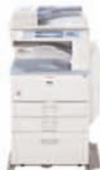
MP 2550SP/MP 3350SP

For robust copying and a flexible upgrade path to black & white scanning, printing and faxing.